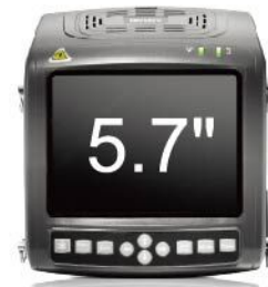
5.7 Inch high resolution colour TFT LCD monitor forming a clear image under the sunshine for special treatment.