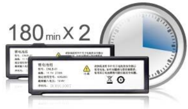
Two large-capacity lithium batteries, about 360 minutes work.