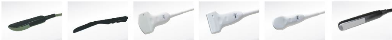
2.0/2.5/4.0/5.0Mhz Rectal Convex Probe 4.0/5.0/6.5/7.5Mhz Rectal Linear Probe (with handle) 2.0/2.5/3.5/5.0Mhz Convex Array Probe 5.0/6.5/7.5/9.0Mhz Linear Array Probe 4.0/5.0/6.0/7.5Mhz Micro-convex Array Probe 4.0/5.0/6.5/7.5Mhz Rectal Linear Probe (without handle)