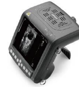
The main unit with the splash-proof, dust-proof function, easy to clean.