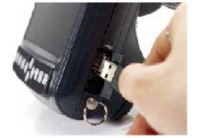
High speed USB socket supporting flash stick storage