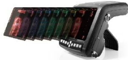
8 kinds of internal Pseudo color display