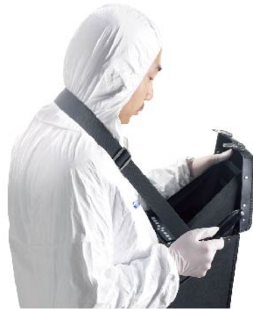
Leather box cover used for shielding sunshine outdoor to observe images easily