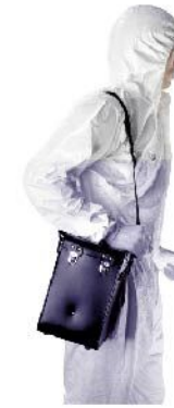
Backpack integration design, support outdoor emergency at any time