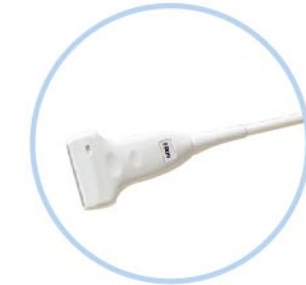
5.0/6.5/7.5/9.0MHz high-frequency linear array probe