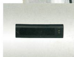
Large capacity lithium battery