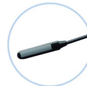
4.0/5.0/6.5/7.5MHz transrectal linear probe