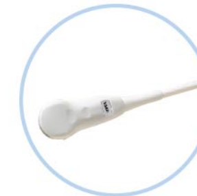
5.0/6.5/7.5/9.0MHz micro-convex probe