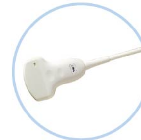
2.0/2.5/3.5/5.0MHz convex array probe