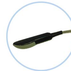
2.0/2.5/3.5/5.0MHz transrectal convex probe