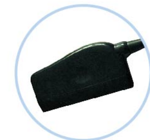
2.0/2.5/3.5/5.0MHz linear loin probe