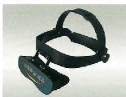
Goggles (Video Glass)