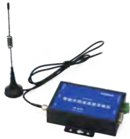
KPM950A smart wireless data collector

The KPM950 series smart wireless data collector is used for communicating with the sensors in the effective range, receiving the radio wave signals sent by the wireless sensors, and converting the temperature information into a host recognizable level communication signal, and uploading it to the T@Power smart power distribution inspection and monitoring system. Receiving sensitivity and wideband reception feature reduce the transmit power requirement of the wireless sensor, which helps to extend the life of the built-in battery type sensor and enhance the anti-interference performance of the temperature measurement system.