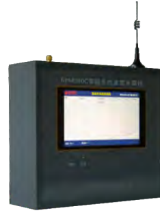
KPM950C smart wireless data collector