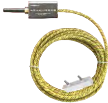
KPM930 Smart wireless water immersion sensor

KPM930 smart wireless water immersion sensor, using the principle of liquid conduction: two-pole probe is insulated by air in normal status; when water contacts the sensor probe, the main control chip accurately determines the state by calculating the change of resistance value, and sends a wireless signal to the collector. When the probe is immersed to a height of about 1 mm, an alarm signal is generated.