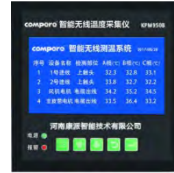
KPM950B smart wireless data collector