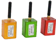
KPM910A bus type