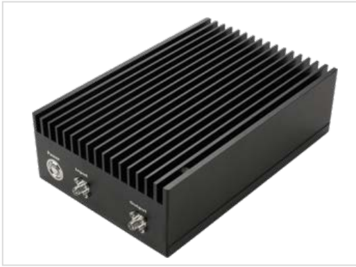
Note: The photo is for illustration purposes only. Please refer to outline drawing